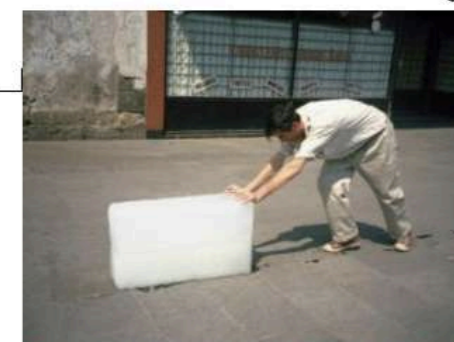
Sometimes making something leads to nothing (Paradox of Praxis #1) Francis Alÿs, 1997, MX, Single Channel Video, 09:54 min

In der als grösste Metropole der Welt geltenden Stadt México City sind Kriminalität, Verkehrschaos und Umweltverschmutzung eine allgegenwärtige Bedrohung. In diesem fast apokalyptischen Umfeld wuchert eine spannende Kunstszene, deren Exponenten den Fokus auf die politische und soziale Lage dieses urbanen Körpers richten. Eine Kunstszene, die dank ihrer eindrücklich starken Arbeiten internationale Bedeutung erlangt hat. Gewalt und soziale Konflikte im urbanen Raum, die auch mit der Geschichte